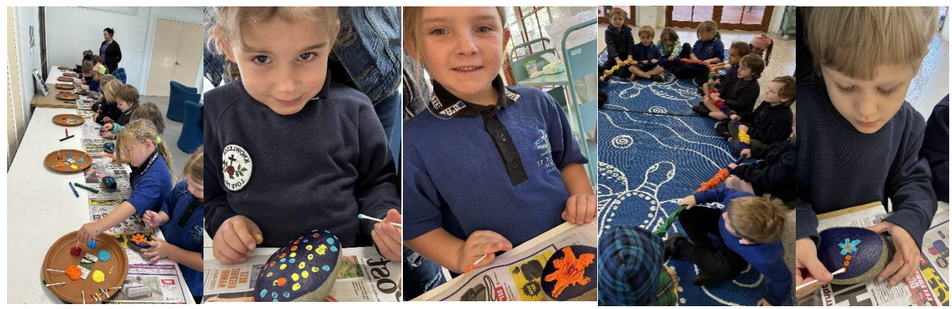
Rhyme Time at the Ravenshoe Library. After songs and a story, the children painted beautiful rocks to celebrate NAIDOC Week. There were many beautifully finished products!

One of our classmates went to the beach on the weekend and brought in show and share . The children loved it.